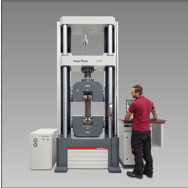
Z1000E with hydraulic grips